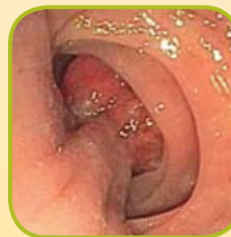
Polyp on Stalk